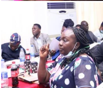
Scenes from the facilitated discussion sessions